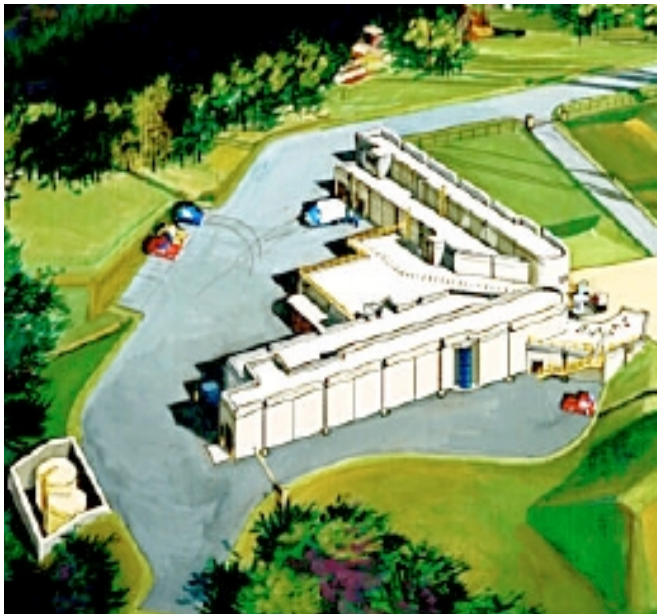
DARHT Facility from Status of the [DARHT] Facility , M. J. Burns et al, LANL, linac96.web.cern.ch/Linac96/Compendium/PAPERS/THURSDAY/THP85.PDF

NNSA has sought to relocate the pit production mission to LANL. Requested funding for this campaign for FY04 is $320.2 million, a 35.7% increase over FY03. By the time that LANL is scheduled to produce its first certified (i.e., ready for the stockpile) pit in FY07 it is estimated that it will have cost $1.7 billion. Included in this campaign for FY04 is $20.7 million for the design of a Modern Pit Facility (MPF) , which will be capable of producing up to 500 pits per year (comparable to Cold War rates!). The NNSA's official justification for the MPF is that LANL's pit production rates will be too limited for future "capacity" requirements and that the facility will provide the "flexibility" to produce new-design pits (in other words, new nuclear weapons). The MPF is scheduled to be completed in 2011 at an estimated cost of up to $4.1 billion.