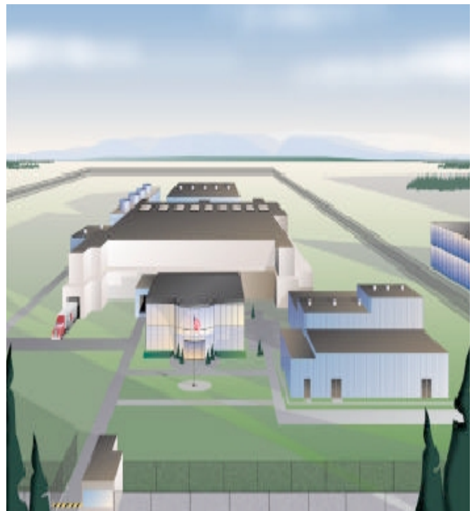
Conceptual Drawing of the Modern Pit Facility, from MPF Fact Sheet , NNSA, October 2002, www.mpfefs.com/PDFs/MPFfs_1.pdf The future location of the MPF will likely be at the DOE's Savannah River Site in South Carolina or the Waste Isolation Pilot Plant in Carlsbad, New Mexico.

Campaigns are “multi-year, multi-functional efforts... [that] provide specialized knowledge and technical support to the directed stockpile work on the nuclear weapons stockpile.” Prominent among the eighteen NNSA campaigns is the “ Pit Manufacturing and Certification Campaign ,” which seeks to reestablish plutonium pit production. Plutonium pits are the triggers for modern thermonuclear weapons, for which DOE lost production capability after the FBI raided the Rocky Flats Plant in 1989 while investigating environmental crimes. Since that time the