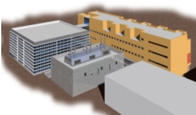
Conceptual Drawing of the MESA Facility: SNL, www.sandia.gov/media/NewsRel/NR1999/images/jpg/MESA.jpg

• The Microsystems And Engineering Sciences Application Facility (MESA) at Sandia; total cost $518.5 million, $61.8 million in FY04, completion 2011. This is the second biggest project currently under construction in the nuclear weapons complex after the National Ignition Facility at the Lawrence Livermore National Laboratory (LLNL) in California. The purpose of MESA is to incorporate emerging microtechnologies into nuclear weapons components. Sandia calls MESA “the cornerstone of 21 st century weapons development.”