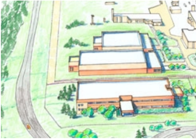
CMR Replacement Conceptual Drawing: LANL Daily News Bulletin , 7-24-2002, www.lanl.gov/orgs/pa/newsbulletin/images/CMR_rendition.jpg

• The Microsystems And Engineering Sciences Application Facility (MESA) at Sandia; total cost $518.5 million, $61.8 million in FY04, completion 2011. This is the second biggest project currently under construction in the nuclear weapons complex after the National Ignition Facility at the Lawrence Livermore National Laboratory (LLNL) in California. The purpose of MESA is to incorporate emerging microtechnologies into nuclear weapons components. Sandia calls MESA “the cornerstone of 21 st century weapons development.”