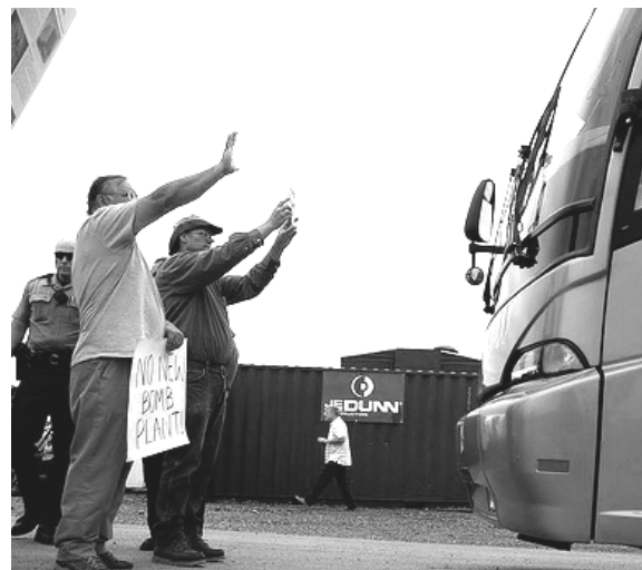
Protesters stopping dignitary bus at KCP groundbreaking.

The new Kansas City Plant is the first major new nuclear weapons production plant that the U.S. has built in 35 years